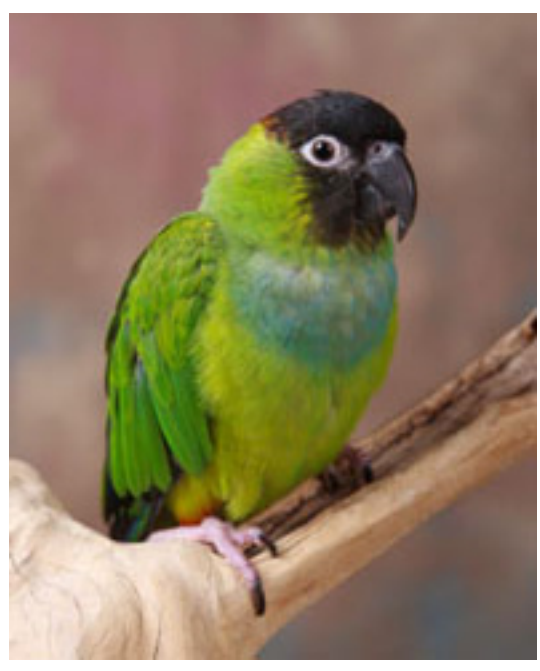
Gus the Conure