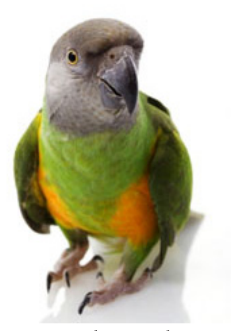
Spencer the Senegal