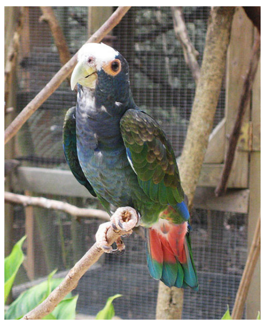
Iade the Pionus